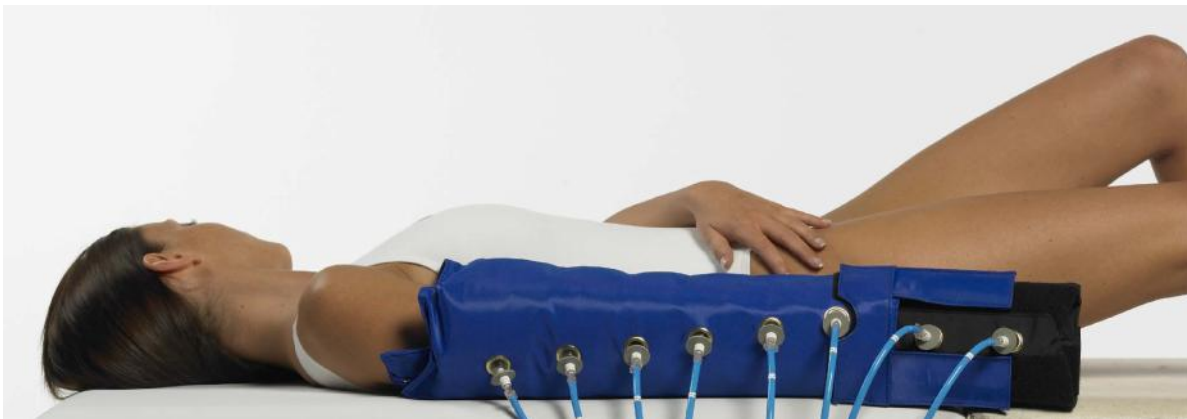
ARM WITH SEPARATE HAND