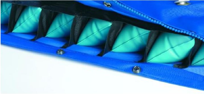
INTERNAL PNEUMATIC BAGS PARTIALLY OVERLAPPED