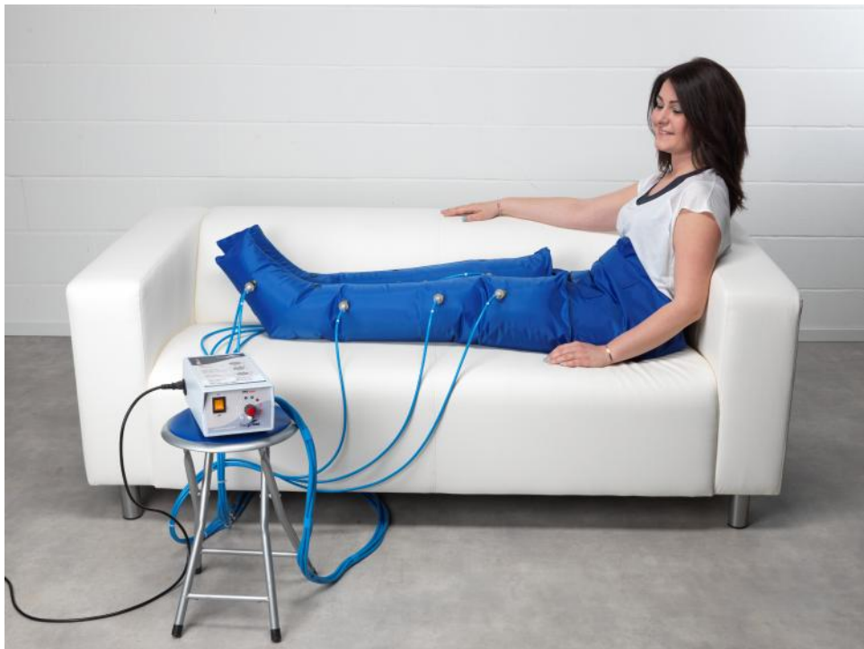
FP MINI WITH DOUBLE LEG SLEEVES AND ABDOMINAL STRIP