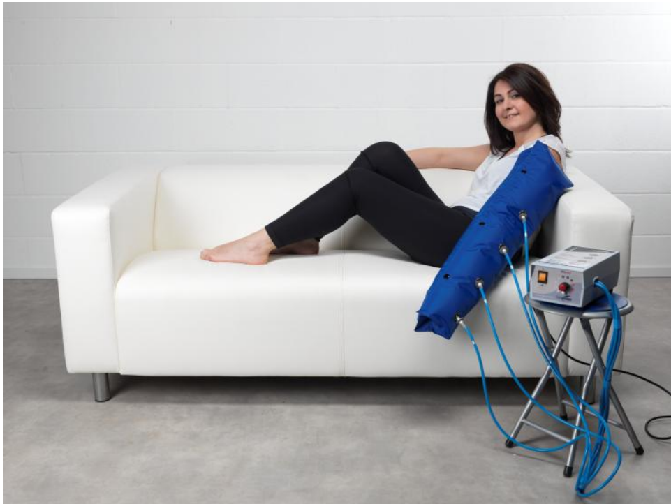
FP 4 MINI WITH SINGLE ARM SLEEVE