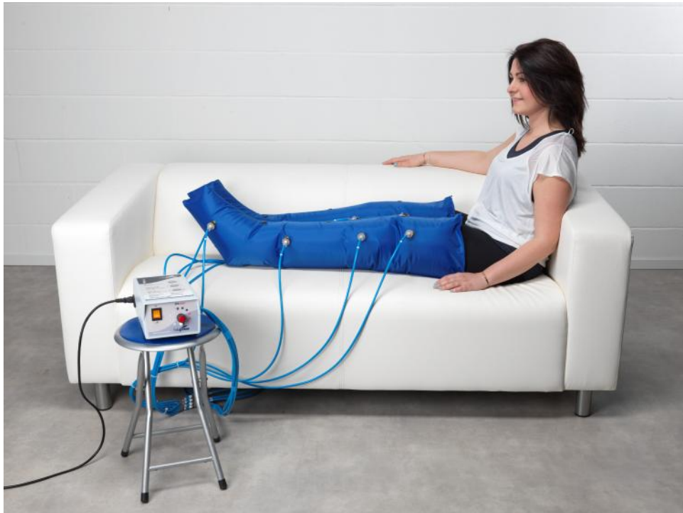
FP MINI WITH DOUBLE LEG SLEEVES